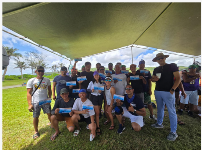
2024 - 2nd Quarter Employee Appreciation